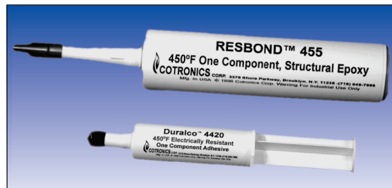
Single Component Adhesive in Ready to Use 4 oz. and 11 oz. Caulking Tubes