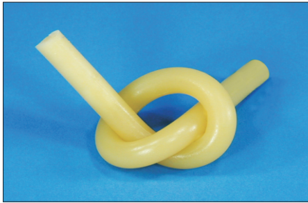
Epoxy So Flexible You Can Tie it in a Knot