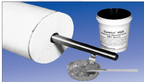
4525 Bonds a 316 S.S. Shaft to a Ceramic Piston Repairing a High Temperature Acid Pump

Quantity Prices & Custom Formulations Available on Request