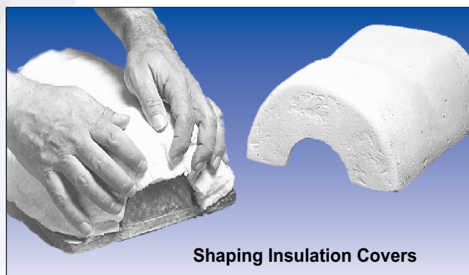
Shaping Insulation Covers

Wrap-It moldable sheets are ideal for molten metal handling, thermal insulation, fire proofing, burner chambers, field repair, welding supports, fixtures and molten metal dams.