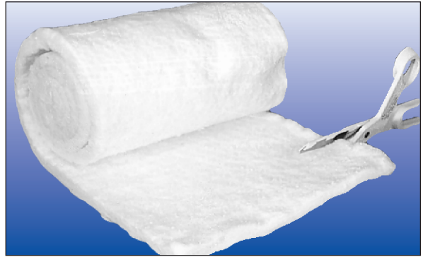
Cutting 370 Insulation for a 2000°F Nuclear Instrument

Use Rescor™ 370FT (Aluminum foil backed blanket) for additional insulation and handling strength. Ideal for use as a reflective barrier.