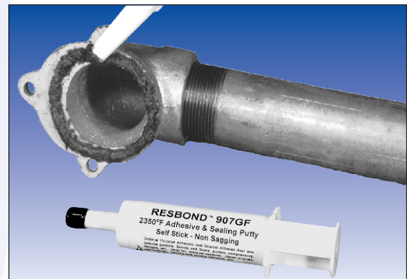
Applying 907GF to a Flange Forming a Hi-Temp. Seal