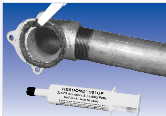
Applying 907GF to a Flange Forming a Hi-Temp. Seal