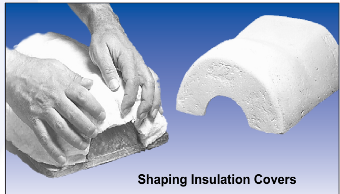
Shaping Insulation Covers

Wrap-It moldable sheets are ideal for molten metal handling, thermal insulation, fire proofing, burner chambers, field repair, welding supports, fixtures and molten metal dams.