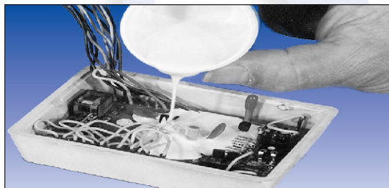
Duraseal 1533 Flows into the Finest Details