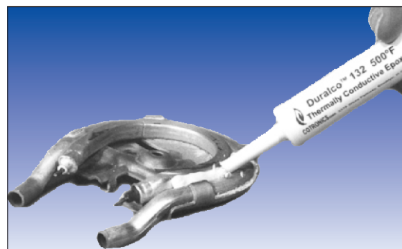
Duralco 132 Bonds Electrical Heating Element for Fluid Heating