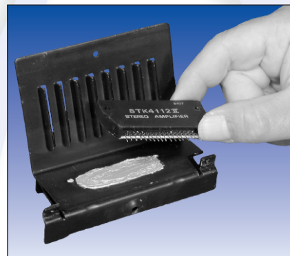
Duralco 132 Dissipates Heat in a Semiconductor Device

* Cures can be accelerated with mild heat.