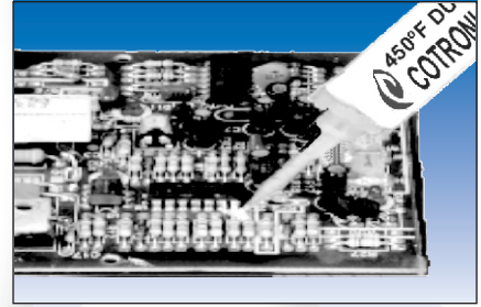
Duralco™ 125 Replaces Soldering on a Circuit Board