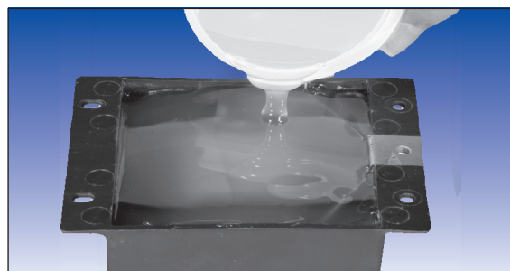
4461 Potting a Transformer for High Temp. Use