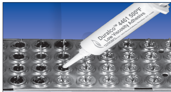
4461 Penetrates and Encapsulates A Semi-Conductor Device

4461 Pots a transformer for high temperature service.