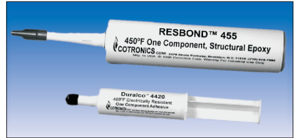
Single Component Adhesive in Ready to Use 4 oz. and 11 oz. Caulking Tubes