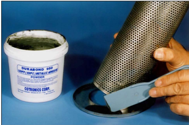
Durabond 950 Bonds a Stainless Filter Cartridge for use at 1200°F