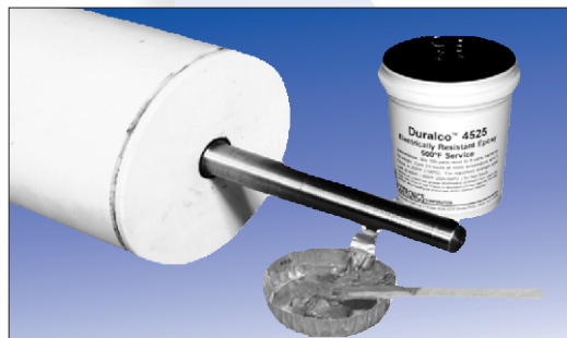
4525 Bonds a 316 S.S. Shaft to a Ceramic Piston Repairing a High Temperature Acid Pump