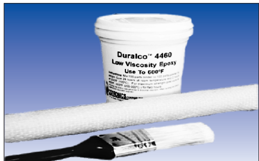
4460 Coats, Moisture Proofs, Seals and Protects Ceramic Sleeving