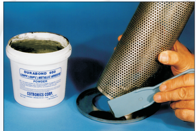
Durabond 954 Bonds a Stainless Filter Cartridge for use at 1200°F